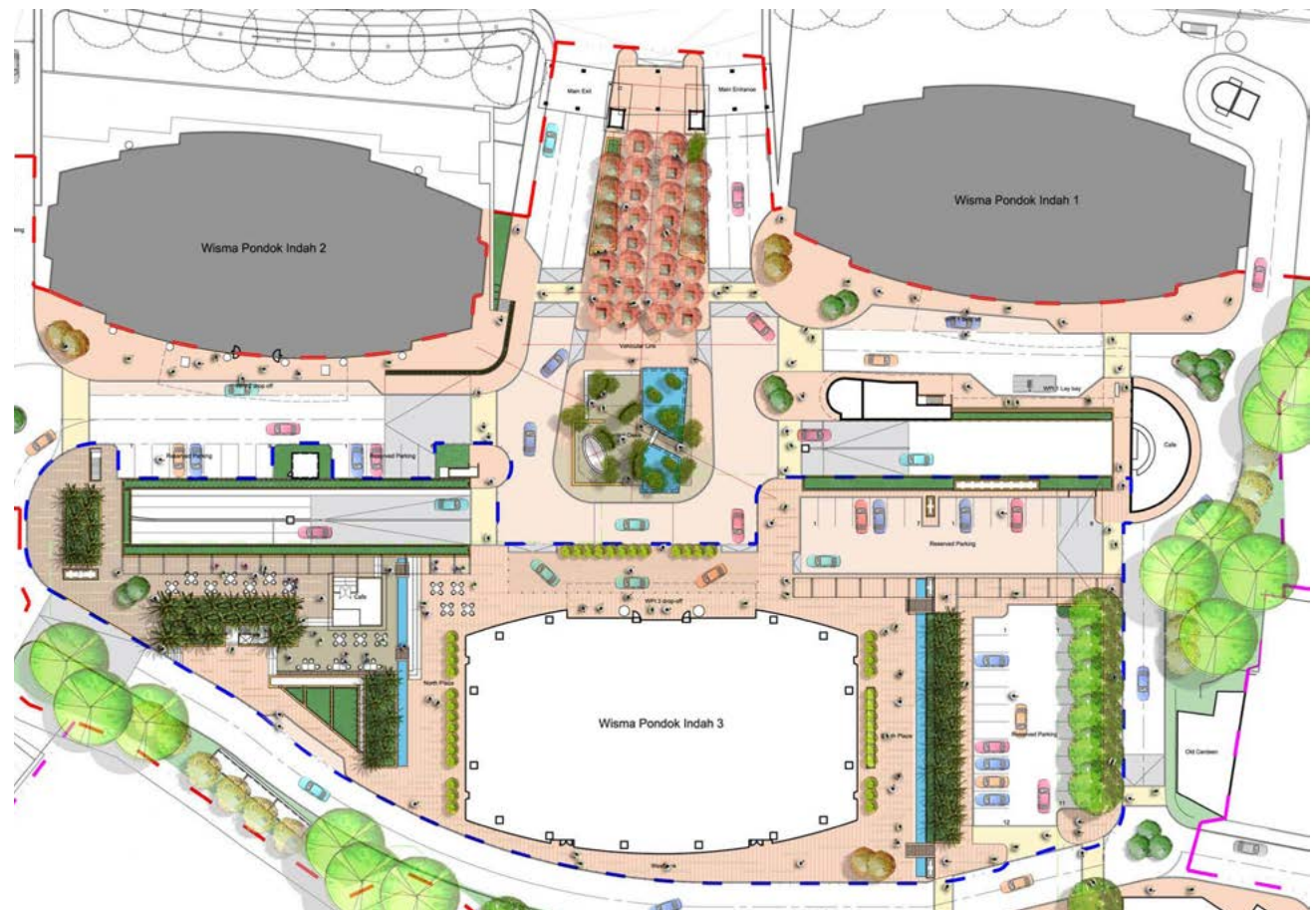
Illustrative plan - The entire landscape is constructed over underground car parks so the planting scheme is highly constrained

The gridded pattern of the paving, together with the linear canals and straight lines and grids of trees, reflect the geometry of the market gardens which once stretched across the Pondok Indah district. The raised planters, planted with tall Livistona palms, echo this pattern and are designed to increase the impact of the vegetation within the context of some very large buildings. The planters also shelter a raised café terrace, which overlooks one of the canals. At the centre of the mall, a new 'crossover' space provides a meeting point and focus for views. The scattered pattern of palms and sculptural flowering trees across this area contrasts with the grid and suggests the dynamic, random flows of people, who enliven these spaces throughout the day.