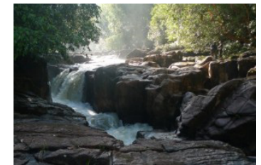
Inspiration from natural river scapes - from upstream rocky cascades and boulder strewn channels, to gravel terraces, islands and reflective pools further downstream