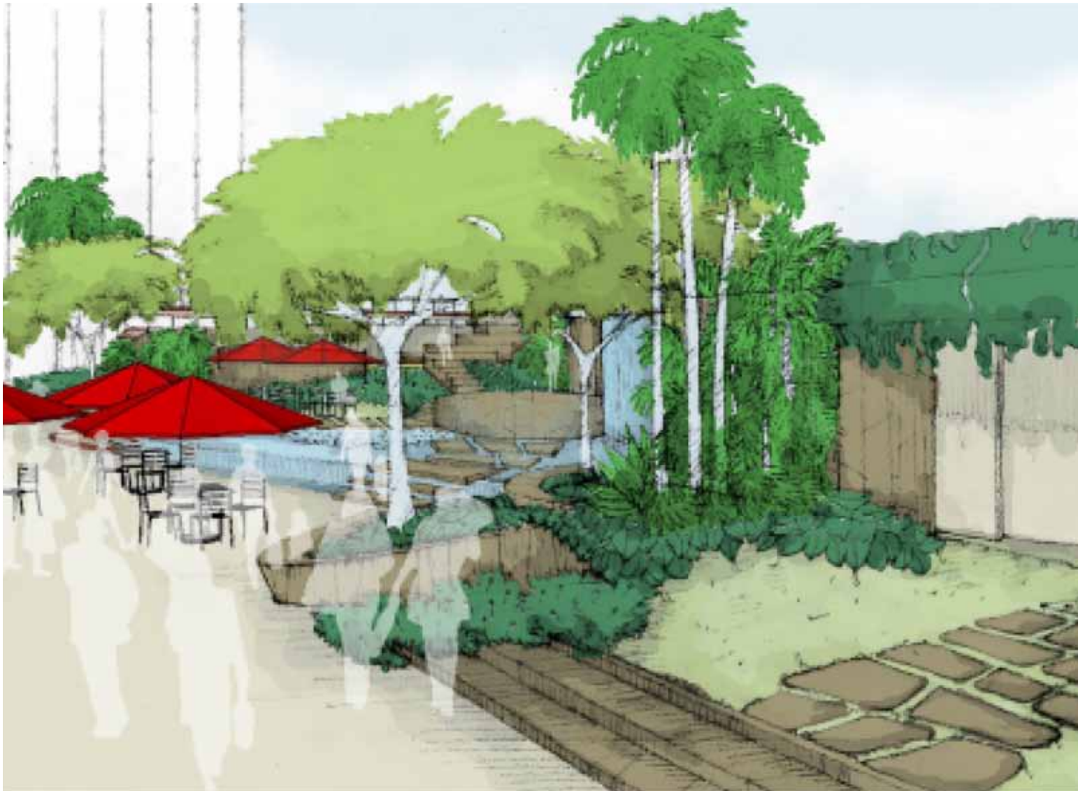
Sketch - meeting, walking and dining in the shady Sunken Garden